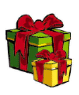
DEC 11 2017